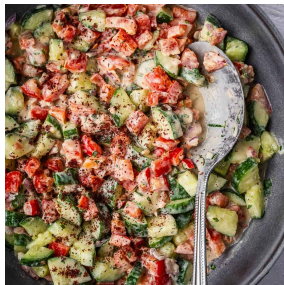
Tahini Salad (Levantine Salata with Cucumber and Tomato)