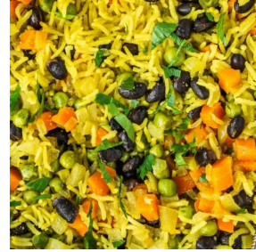
Middle Eastern Vegetable Rice Pilaf