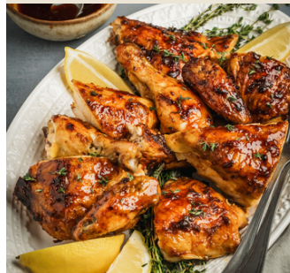
Harissa Honey Chicken