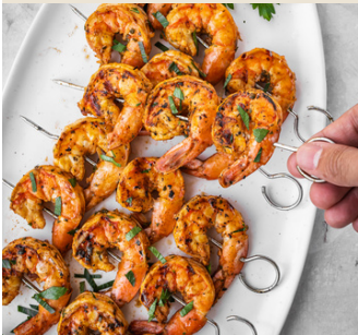
Old Bay Shrimp Skewers