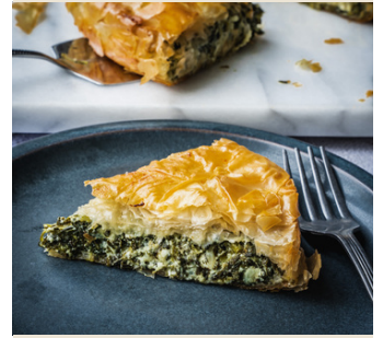
Greek Spinach Pie