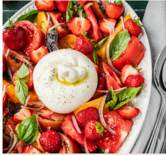
Strawberry Burrata Salad