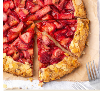
Strawberry Rhubarb Galette