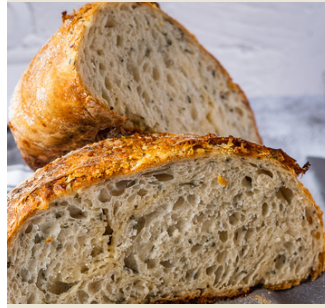
No Knead Loaf