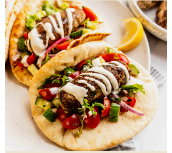
Turkey Kofta Wraps