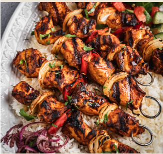
Harissa Chicken Skewers